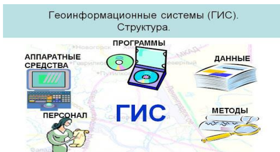
Figure 1. The structure of the geoinformation system.

Introduction. Geoinformation technologies are aimed at the practical application of data expressed in the form of electronic mapping systems and data processing environments of various natures. The main class of geoinformation systems consists of coordinate data that store geometric information and reflect the spatial aspect. The main types of coordinate data are: point (nodes, ends), line (open), contour (closed line), polygon (sphere). In practice, a large amount of data is used to build real objects. These are: hanging point, pseudode, normal knot, coating, layer, and so on. These data types have different relationships to each other. Vector and raster models form the basis of visual representation of data using GIS technologies. Vector models are based on the representation of geometric information using vectors. In raster models, the object (region) is reflected in the spatial cells that make up the periodic table. Each cell of the raster model has the same level of parts, but different in characteristics (color, density). This procedure is called scaling. Raster models are regular, irregular and recursive or hierarchical. There are three types of flat regular mosaics: square, triangular and hexagonal. The square shape is convenient for processing large amounts of information, creating triangular spherical surfaces. Irregularly shaped triangular grids and Tissen polygons are used as irregular mosaics. [1]